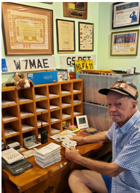
by Bob Hatter, W7MAE

If you work a DX station you probably want that station's QSL card. An easy way to get it is to use the ARRL QSL Service. It's easy, and even better, it's free! You do NOT need to be an ARRL member to participate. Just follow a few simple instructions.